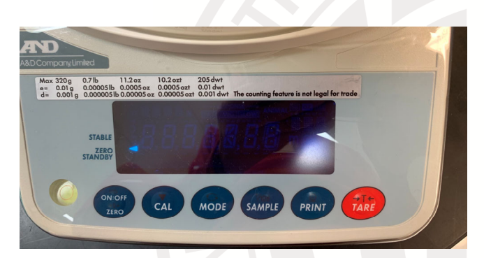
Display with e=10d markings and function buttons