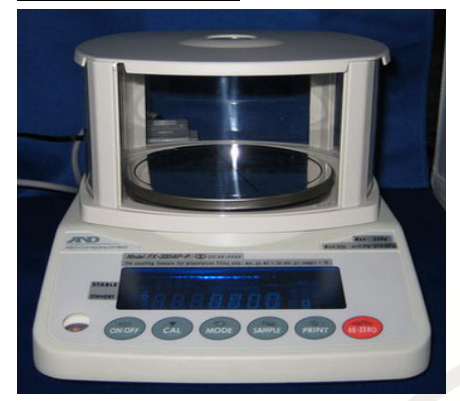
Model FX-300iN – Front View