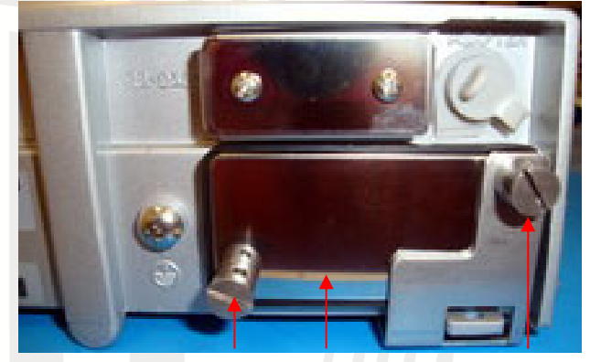
Model FX 3000iWP-P - Calibration Plate and Screws View