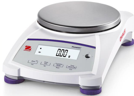
Model: Px822Nz, Px2201Nz, Px2202Nz, Px4201Nz, Px4202Nz, Px5202Nz, Px6201Nz, and Px8201Nz