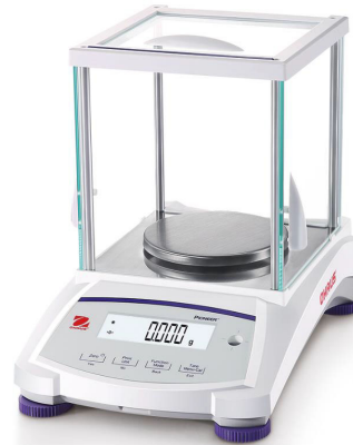
Model: Px323Nz, Px523Nz, Px623Nz